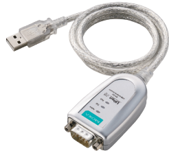
Terminal Block Adaptor for UPort® 1130/1130I/1150/1150I