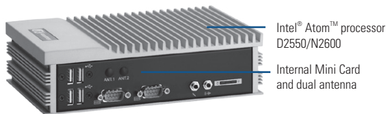
▲ Front view

Fanless Embedded System with Intel® Atom™ Processor N2600 1.6 GHz or D2550 1.86 GHz, VGA and DisplayPort, 2 GbE LAN, 6 USB and 4 COM